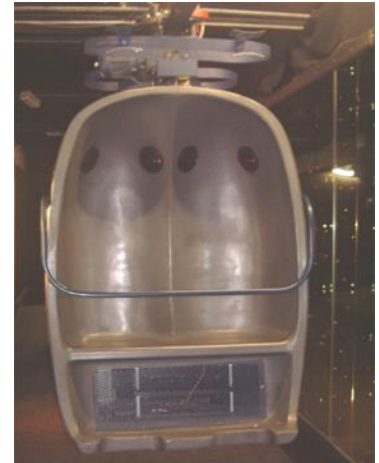
Standard Ride Car