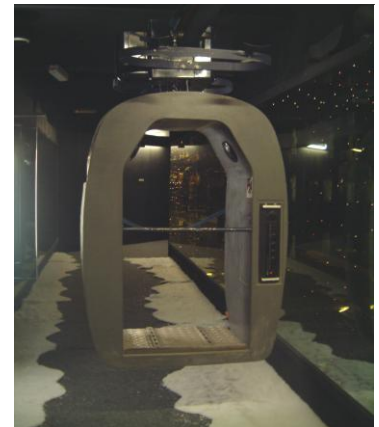
Wheelchair Adapted Car