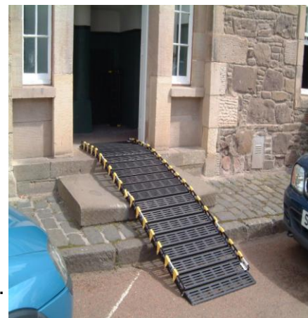
Roll-a-ramp at the Millworkers House

If you wish to visit these areas please ask the staff on duty for advice & assistance.