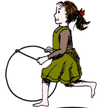
Annie plays with a gird'n'cleek

The cotton mills at New Lanark carried on spinning cotton until they finally closed in 1968. You can still see the mill village today. It is looked after by New Lanark Trust. The buildings are over 200 years old. People still live in the houses, which are modern inside but look old from the outside. The mills no longer make cotton thread. They have been 'recycled' and given new uses. There is a Visitor Centre; Mill One is now a hotel and Mill 3 contains a café, shop and some of the exhibitions including a Roof Garden! New Lanark is a World Heritage Site, and people come from all over the world to visit this special village, just like they did when Robert Owen was here!